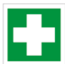
A widely used symbol for first aid